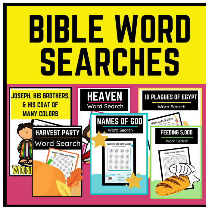
Bible Word Search Mega Pack