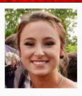
It was amount to be able to learn more about making my own product! At lest, I was nervous considering I did not have my idea to start off, but this was an awesome experience."