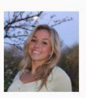
'Any teenagers looking to become an entrepreneur should go through this program before jumping right into sturing up their business."