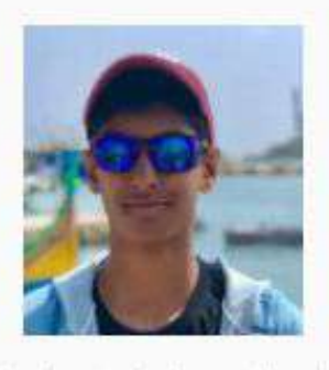
Tenjoyed every step along the way and inamed a for from this course. Through Beta Bowl, my eyes opened to the world of business and I am more interested in inaming the field."