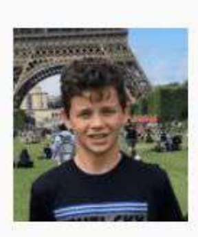
T learned so much over a short period of time and I recommend it to any teen interested in business who wasts to learn more.