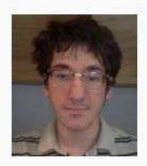
When I entered I wasn't expecting much but they completely blew me away with him focused and targeted it could get I would take it again."