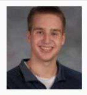
T came into this program having to idea where to start just weeks later I have a business that's almost ready to launch