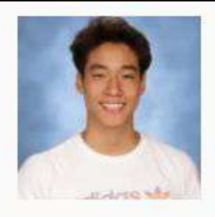
Beta Rowl is a great experience for anyone wanting to learn what it takes & how to start your own fundament.