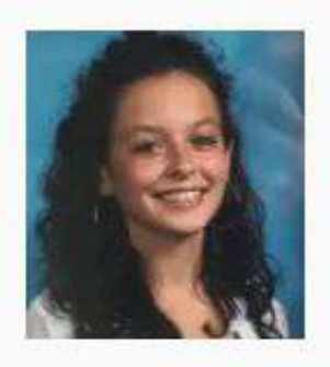
Beta Bowl is a great business and overall financial fearning tool with fantastic resources that also last you a lifetime