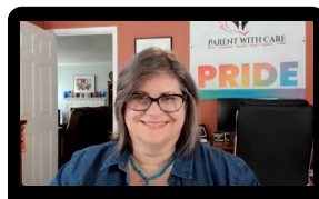
Coming Out & Beyond: LGBTQIA+ Stories | Season 4 Episode 19